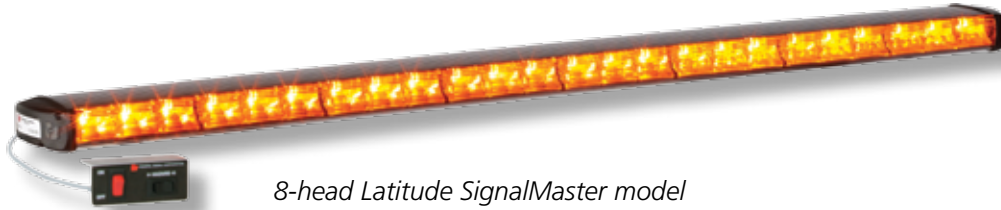
8-head Latitude SignalMaster model (6-head model also available)